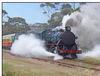
Don River Railway