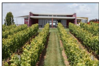
Ghost Rock Vineyard