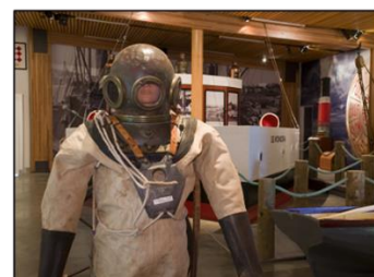
Bass Strait Maritime Centre