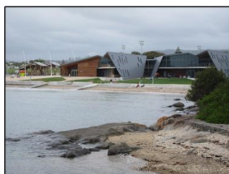
Mersey Bluff Precinct